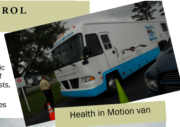
Health in Motion van

One mechanism used for education, prevention and screening utilized by the Northampton County Health Department is the Health in Motion mobile unit, which became available through an initiative of the North-eastern N.C. Partnership for Public Health. The mobile unit is available to NENCPPH partners for education and screenings at health fairs, etc. The mobile unit is staffed by the Brody School of Medicine in Pitt County and is based in Hertford County. Funding for the van was provided by the Kate B. Reynolds Charitable Trust and the AIDS Care Branch.